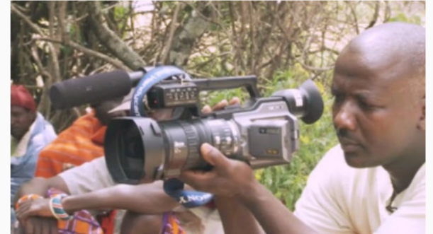
Video: Digitizing Traditional Culture in Kenya .

The TK Documentation Toolkit provides practical guidance on how to undertake a TK documentation exercise.