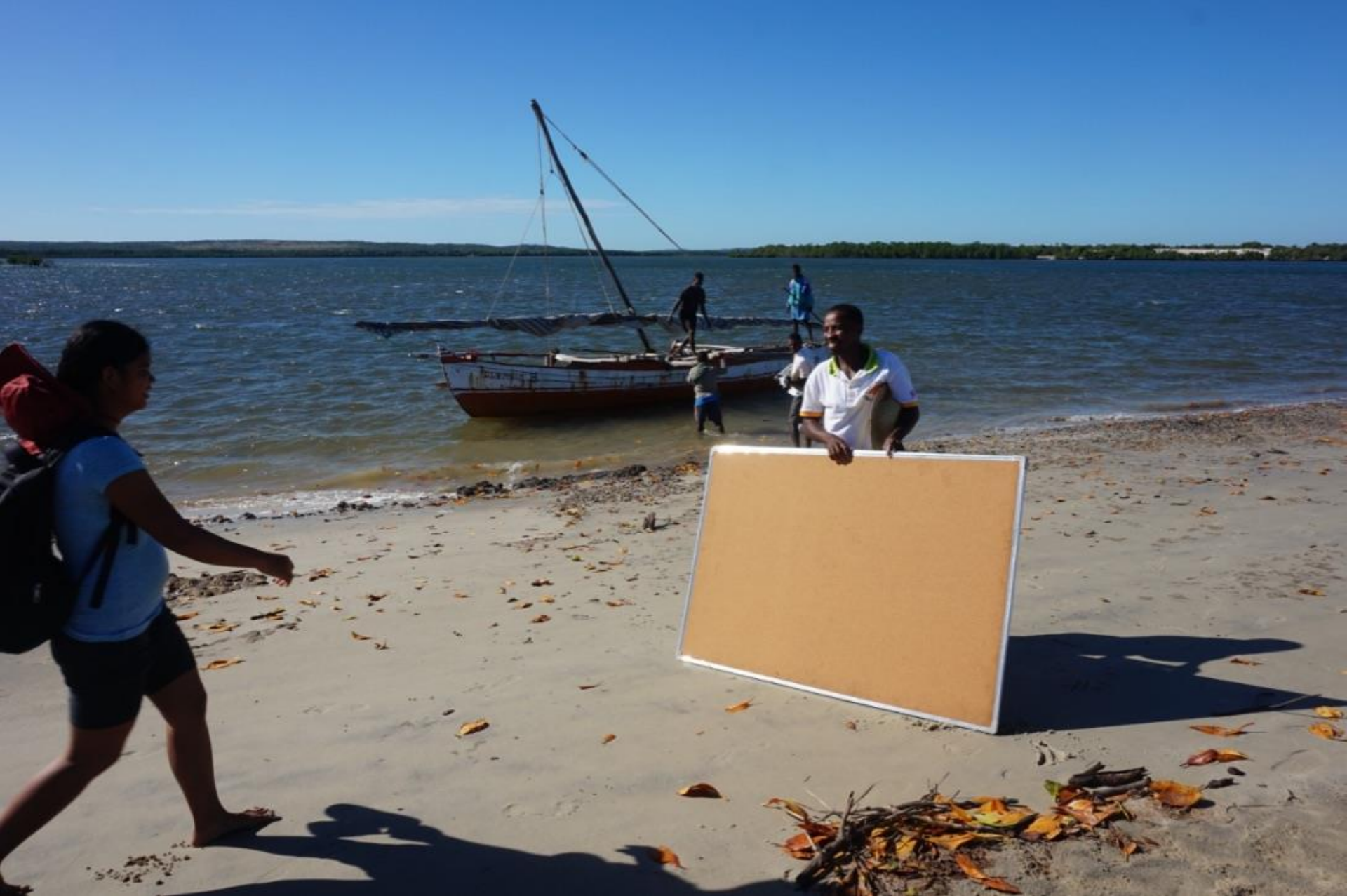
Some examples of communication materials used in Madagascar