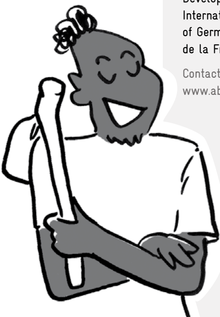
Illustration: © Die Ausbrecher – Atelier für moderne Markenkommunikation.

Design: MediaCompany – Agentur für Kommunikation GmbH