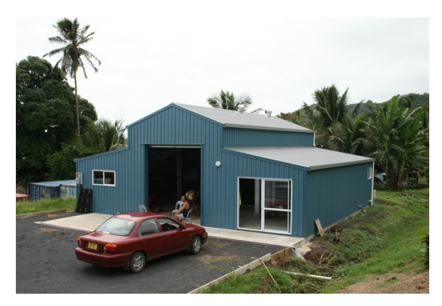
Figure 3: The CIMTECH Facility in Avarua, Rarotonga<sup>5</sup>