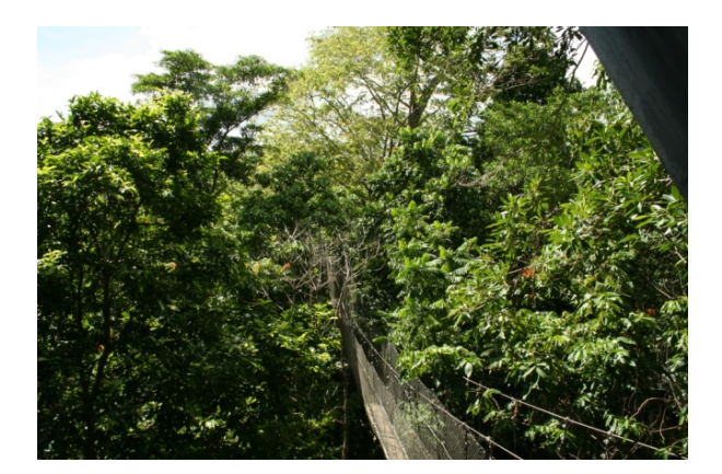
Figure 7: The Rainforest Canopy Walkway Ecotourism Attraction in Falealupo<sup>12</sup>

It is yet to be seen if the future users of synthetics analogs of prostratin will share benefits upon commercialisation of any drugs.