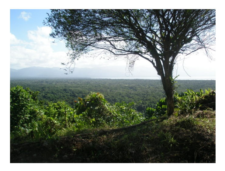
Figure 9: Vatthe Conservation Area and Big Bay in the Background, Santo.<sup>16</sup>

Payment of local communities, guides and assistants occurred during the expedition (Serei Maliu, interview, 14/6/12; Chief Solomon, interview 14/6/12; Purity Solomon, interview, 14/6/12; Bill Tavine, interview, 14/6/12). There were sometimes issues over the amounts paid or the work expected (Kalfatak, 11/6/12). One of the participants anonymously complained about the low wage paid for their research assistant work (anonymous, interview, 12/6/12). In the Vatthe conservation area (see figure 9), researchers paid 600 Vatu (approximately $6 USD) to be used for community conservation as a one-off fee for entry. Purity Solomon from Matantas village noted that this was the only payment or contributions made to the community – other payments were made to individuals (interview, 14/6/12).