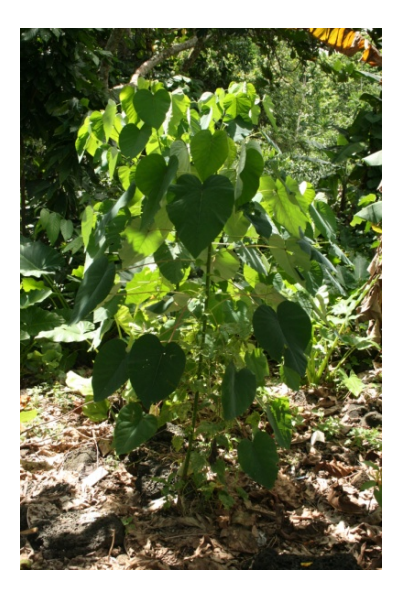
Figure 5: The 'Mamala' tree.