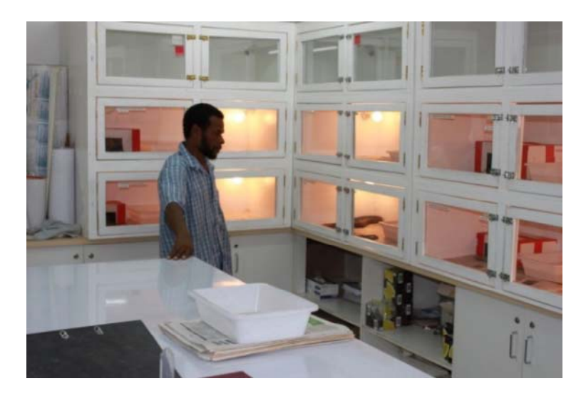
Figure 1: The UPNG Herpetarium.<sup>2</sup>