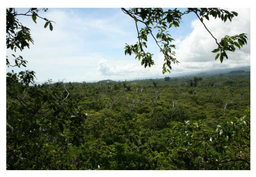
Figure 6: The Falealupo Rainforest<sup>8</sup>

The Falealupo Covenant described briefly above was signed by every chief in Falealupo in a kava ceremony attended by the village (with the exception of one 'banished' family, as noted by several current chiefs).<sup>7</sup> Dr Cox also met with the Samoan Prime Minister Tofilau Eti, the Samoan Minister of Agriculture Solia Papu Va'ai (confirmed by interview in March 2012), and a number of members of parliament to notify them of the preliminary research findings and the NCI's commitment to both honour the Falealupo Covenant and to require any licensee to negotiate fair and equitable terms of benefit-sharing of any proceeds arising from a patent (issued later in 1996) (Cox, 2001). Dr Cox later was involved in the negotiation of two memoranda of understanding establishing terms for potential benefit-sharing between the Samoan Government, the AIDS Research Alliance, and University of California Berkeley. These negotiations involved Mr Solia Papu Va'ai, who was the Member of Parliament for Falealupo at the time. It is unclear to what extent the Falealupo community was involved in negotiation of these two agreements. According to Cox, he took representatives from both the AIDS Research Alliance and the University of California to Falealupo where the village chiefs reviewed and signed the respective benefit-sharing agreements (Cox, pers. comm. 6/6/2012).